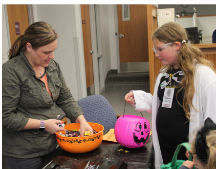
Business trick-or-treating in Houston

Over the years, AcenTek has awarded $325,000 to deserving young adults through scholarships. Each year, AcenTek awards twenty high school seniors a $1,000 scholarship to help with the expense of continuing their education.